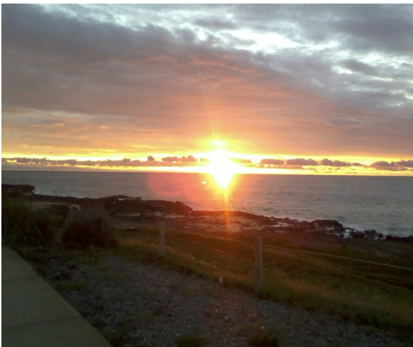
Bunbury's Back Beach at Sunset

Our programme is being finalised and we hope to bring you an extraordinary array of speakers and things to do.