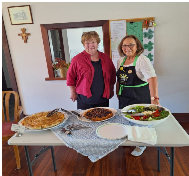
Above: Lunch prepared using olive oil in different ways for participants who attended the Olive Oil Tasting.