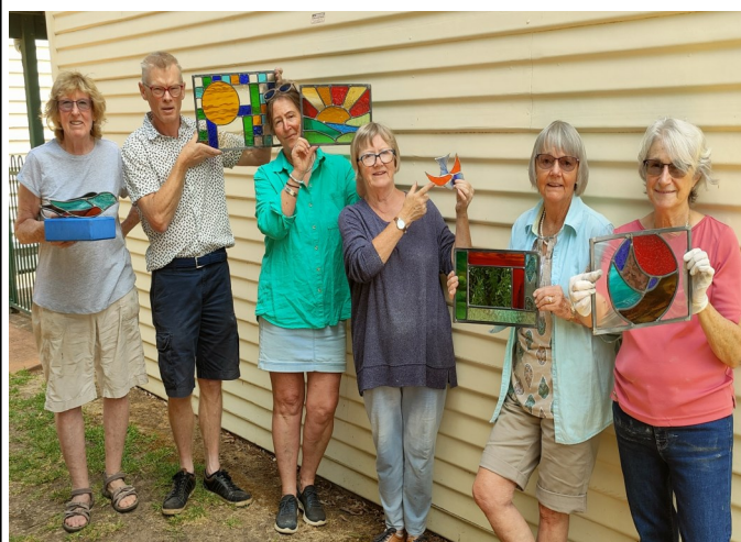
Below: Fun with Glass